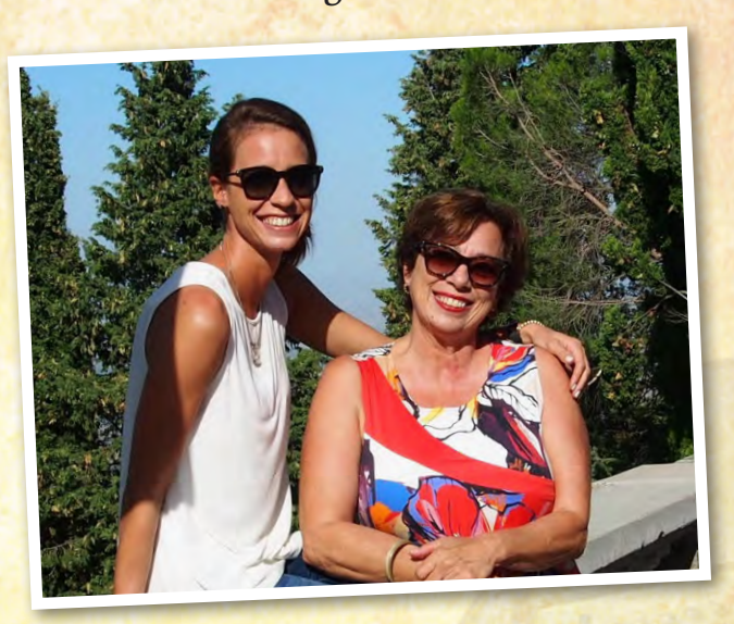
"Our heritage and inner calling has lead us back to our roots in Tuscany. Our passion for Italy inspires us to share the wonders and the beauty of Tuscany with those who tour with us."

We aspire to have this unique journey bring you closer to being a local during your stay in the region and create unforgettable memories.